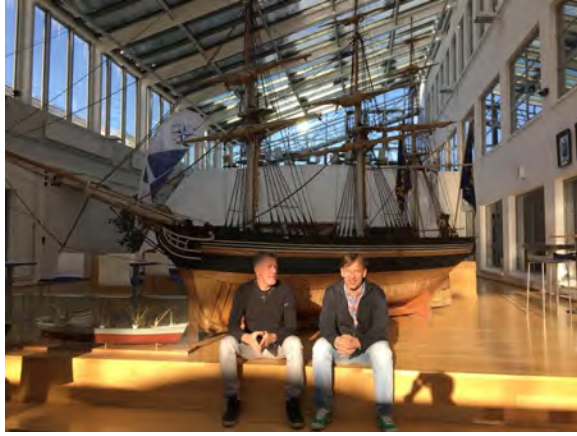
Aboa Mare in Turku