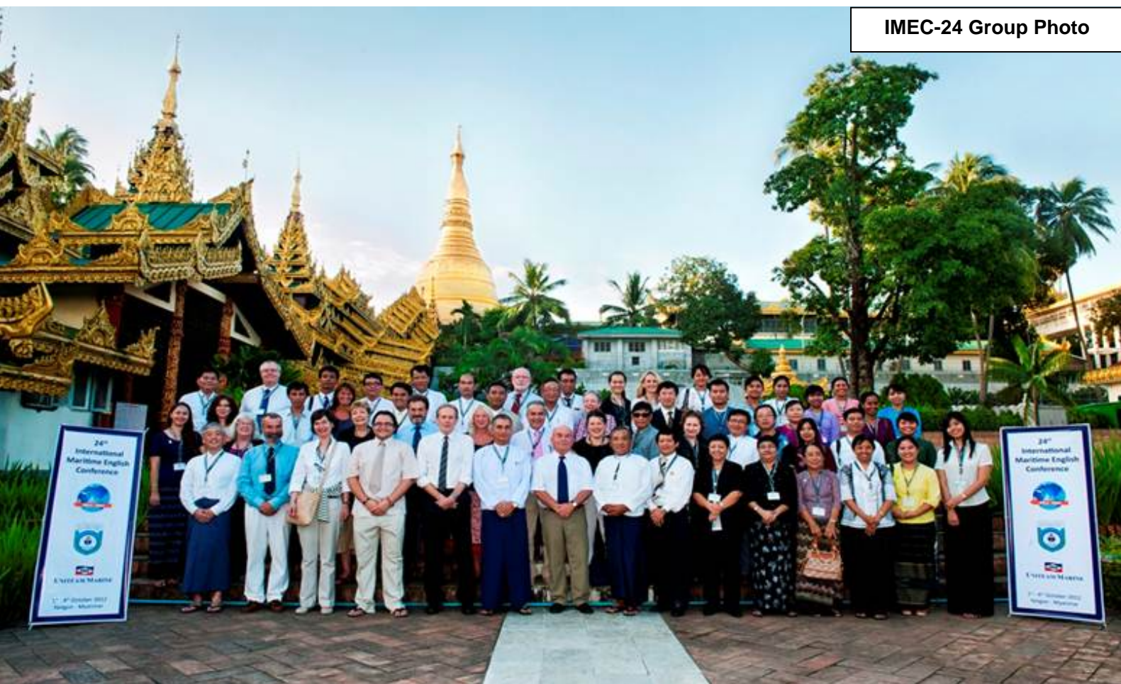
IMEC-24 Group Photo