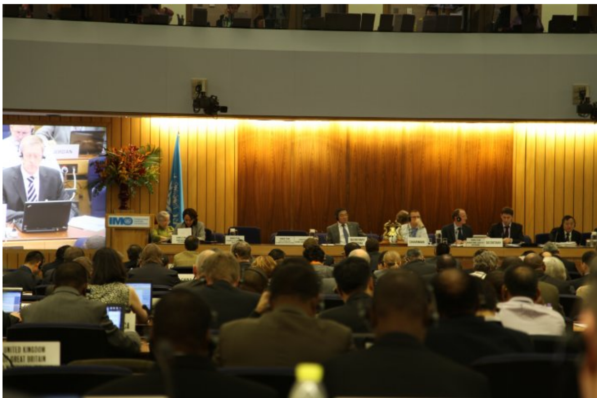
IMO Conference Hall

Before the meeting, IMLA had delivered to IMO MSC proposals on revisions of IMO Standard Marine Communication Phrases.